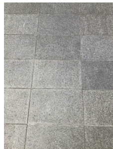
GRANITE TILES AS PER EXISTING