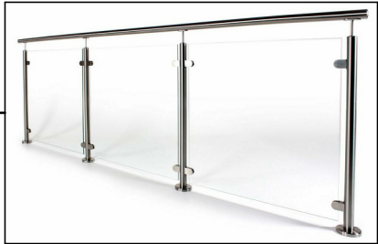
STAINLESS STEEL GLASS BALUSTRADE